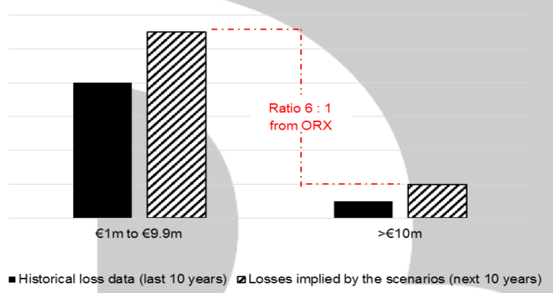
Figure 3: Back-testing a portfolio of scenarios against both historical internal & external losses<sup>1</sup>

The outputs of models for individual scenarios can also be checked against key business metrics to determine the reasonableness of either the scenario and / or the model. The metrics that might be considered include the largest payments; the largest underwrites; the largest 'fat-finger' limits etc. Similarly, for insurable risks, scenarios can be compared to the level of cover and the premium, implying the approximate frequency with which the insurer expects to meet a full claim. At a portfolio level, firms can also currently compare the outputs of their Pillar 2 capital models against AMA firms which helpfully report their AMA numbers by business lines.